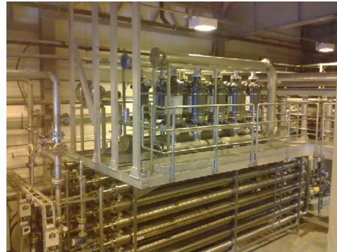
FlooRO™ Reverse Osmosis