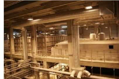
Raw water treatment plant